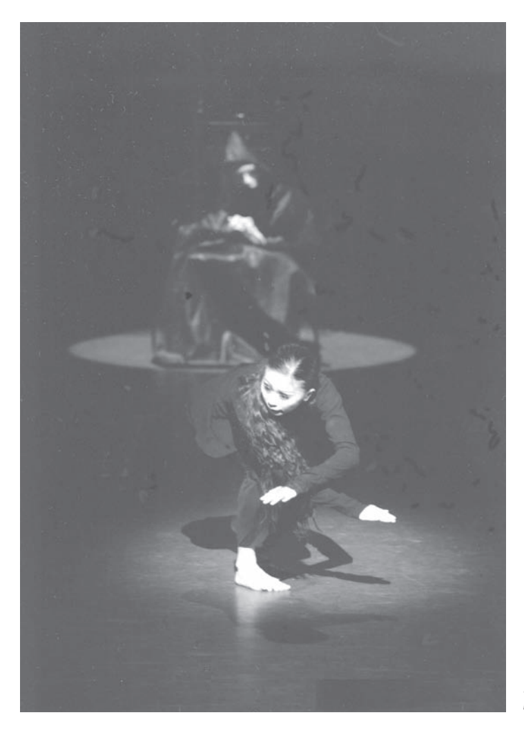
Saeko, Veil, 2003.

and body image, these dancers represent Japanese contemporary dance.