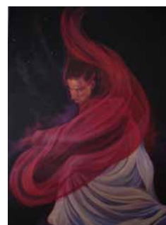
Wings of Sound

Eurythmy Artists from Melbourne, Sydney, Brisbane and Adelaide will perform. Venue: At the Goodwood Institute, 166 Goodwood Road Dates: 20 August Time: 7.30pm Tickets: $25 Bookings: Limited seating so book early on 0417 875 023