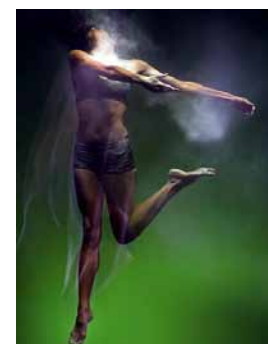
of earth & sky

Venue: Space Theatre, Adelaide Festival Centre Dates: 23 - 24 September Time: 7.30pm Tickets: $35-$15, Family (2 Adult 2 Child) $85 Bookings: Bass 131 246 www.bass.net.au