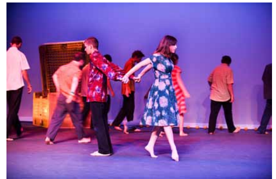
Students from Riverland Special School

Feedback from school staff has also been positive with many enjoying the opportunity to be involved in dance themselves. One teacher commented that she was really impressed with the development of one of her students. "He has been involved in Hip Hop lessons at school, but the Restless Dance sessions have seen his creativity and thinking about dance and movement explode ... there I was struggling to get to different levels, while he was 'flowing up, down, around and everywhere! It was spectacular!"