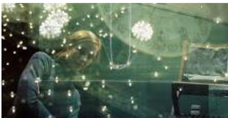
Life in Movement

After an emotional premiere at the 2011 BigPond Adelaide Film Festival, Life in Movement was the recipient of Best Feature Film at the South Australian Screen Awards. The prize is 3 screenings at the Mercury Cinema, so standby for upcoming show times. The film is gaining momentum on the world festival circuit with screenings in the UK over the past month. In June, Life In Movement also took out the Foxtel Documentary Prize at the 2011 Sydney Film Festival. Closer Productions are now finalising a one-hour version of the film and preparing a study guide for use by high school teachers.