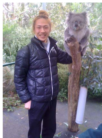
Kaiji meets Koala