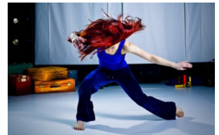
I Left My Shoes on Warm...

Venue: Her Majesty's Theatre Dates: 10 - 13 August Time: Preview Wed 7pm with post show forum, Thurs - Sat 7pm Tickets: $45 - $19.95 Bookings: BASS 131 246 www.bass.net.au