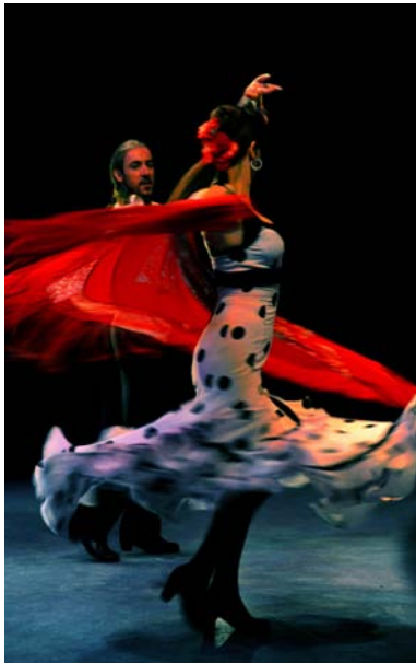
Flamenco Dance Areti