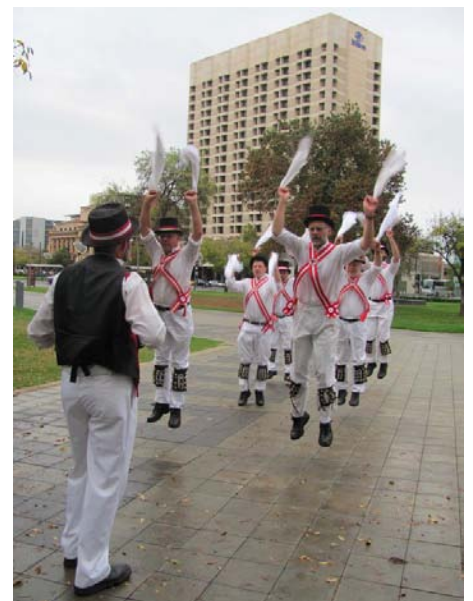
Adelaide Morris Men