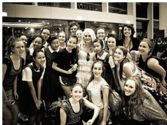
Fresh Bred at the Singapore Youth Festival