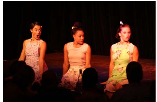
Keeping up with the Jones'

Although that's it for this year's Fringe, we know some of you will have your sights on performing at Adelaide Fringe 2012 – make sure you keep us in the loop about it!