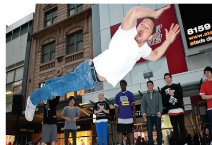
Nokturnal in the Mall

Venue: Her Majesty's Theatre Date: 28 May Time: 4:30pm Tickets: $10 - $20 Bookings: BASS 131 246 or www.bass.net.au