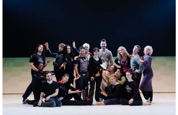
Cast and Crew of ADT