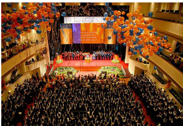
Fresh Bred sets its sights on Singapore's University Cultural Centre Hall

Subject to funding, we will hold auditions for the 2011 Fresh Bred Youth Dance Ensemble . The audition will be held at Ausdance on Sunday 7 August from 1.30pm to 5pm and is open for all secondary dance students. Stay tuned for further details.