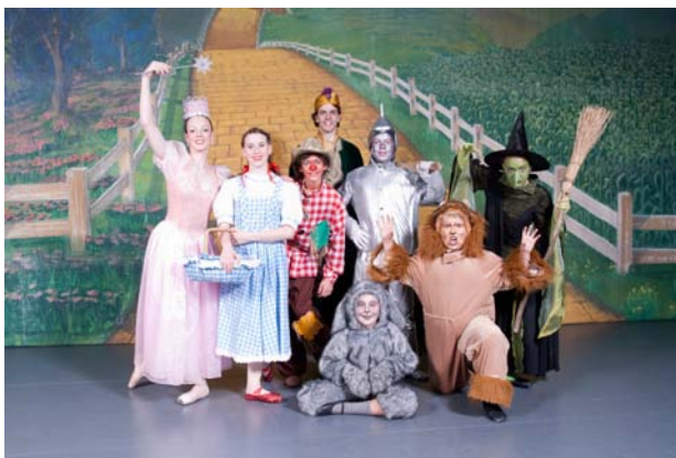
The Wizard of Oz Australian Classical Youth Ballet

Where: Chaffey Theatre, Eighteenth Street, Renmark