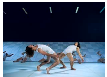
Be Your Self