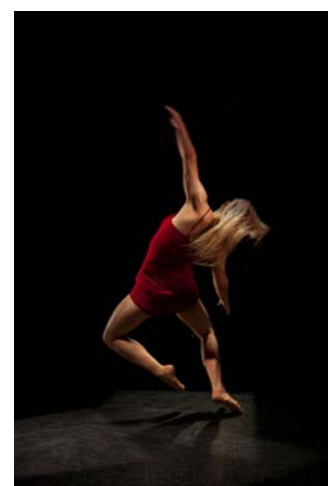
AC Arts 2011 Third Year Dancer

All of the Helpmann Academy's partner institutions play a vital role in making Maestros & Apprentices a truly exhilarating event. In addition to musicians, singers, actors and visual artists from the Academy's partners, the event includes live performances by the 3rd-year dancers from TAFE SA's Adelaide College of the Arts.