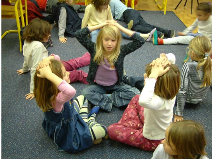
Image 1. Learning math with creative movement: How many triangles could you find? Students from Trnovo Primary School, Ljubljana, first class.

When using holistic methods of teaching and learning, one of them being the creative movement method, children develop in the physical, motor, intellectual, emotional, and social fields. Holistic learning means understanding with both the body and mind.